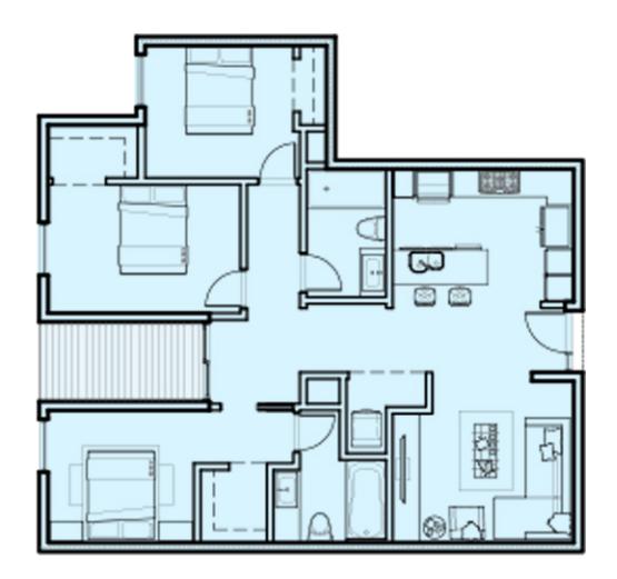
3 BR / 2 BA @ 1270 sf